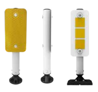
Solid Sheet (OMK2-1)