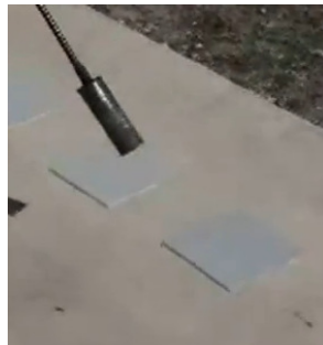
Heating Adhesive Pad