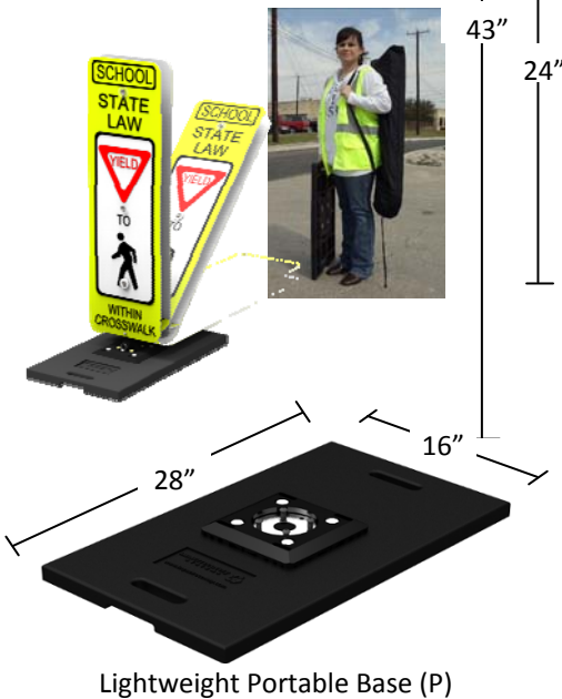
Lightweight Portable Base (P)